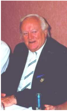
TAF IN 2000 AT A REUNION HELD AT ROWLANDS CASTLE GOLF CLUB

Taffy was born in the small mining village of Brynamman, Dyfed (then Camarthen-shire South Wales, the only son of a mil-liner and a wages clerk. From an early age he showed a keen