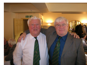
The outgoing (left) and incoming (right) President

delighted that we have allocated more money out of funds to purchase special Old Boys prizes presented to each year group (7-11) at their Year Awards Presentation Days in July. Last Year